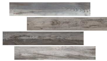
2.5x19 Listel Mosaic on 10x19 Sheet Matte