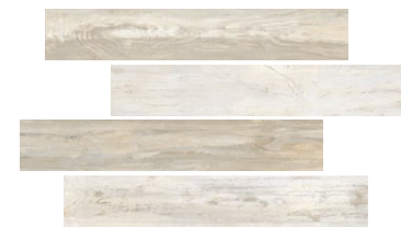
2.5x19 Listel Mosaic on 10x19 Sheet Matte