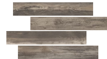
2.5x19 Listel Mosaic on 10x19 Sheet Matte